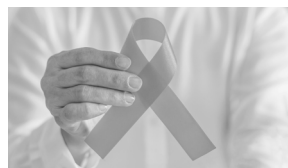
Samaritans for mental health awareness