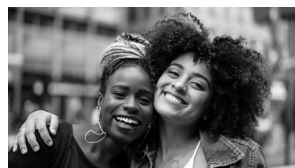
The National Association for the Advancement of Colored People in observance of Juneteenth