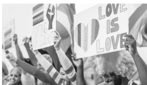
Out Alliance and The TREVOR Project for Pride Month