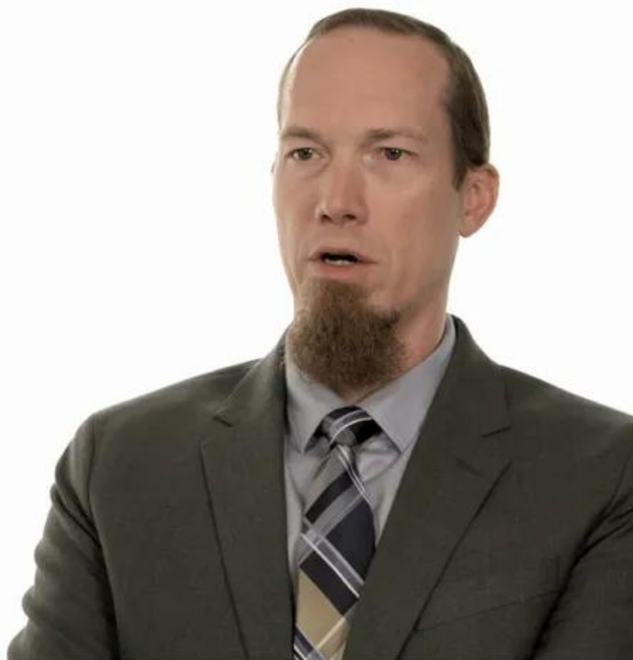
Sheldon Service Products