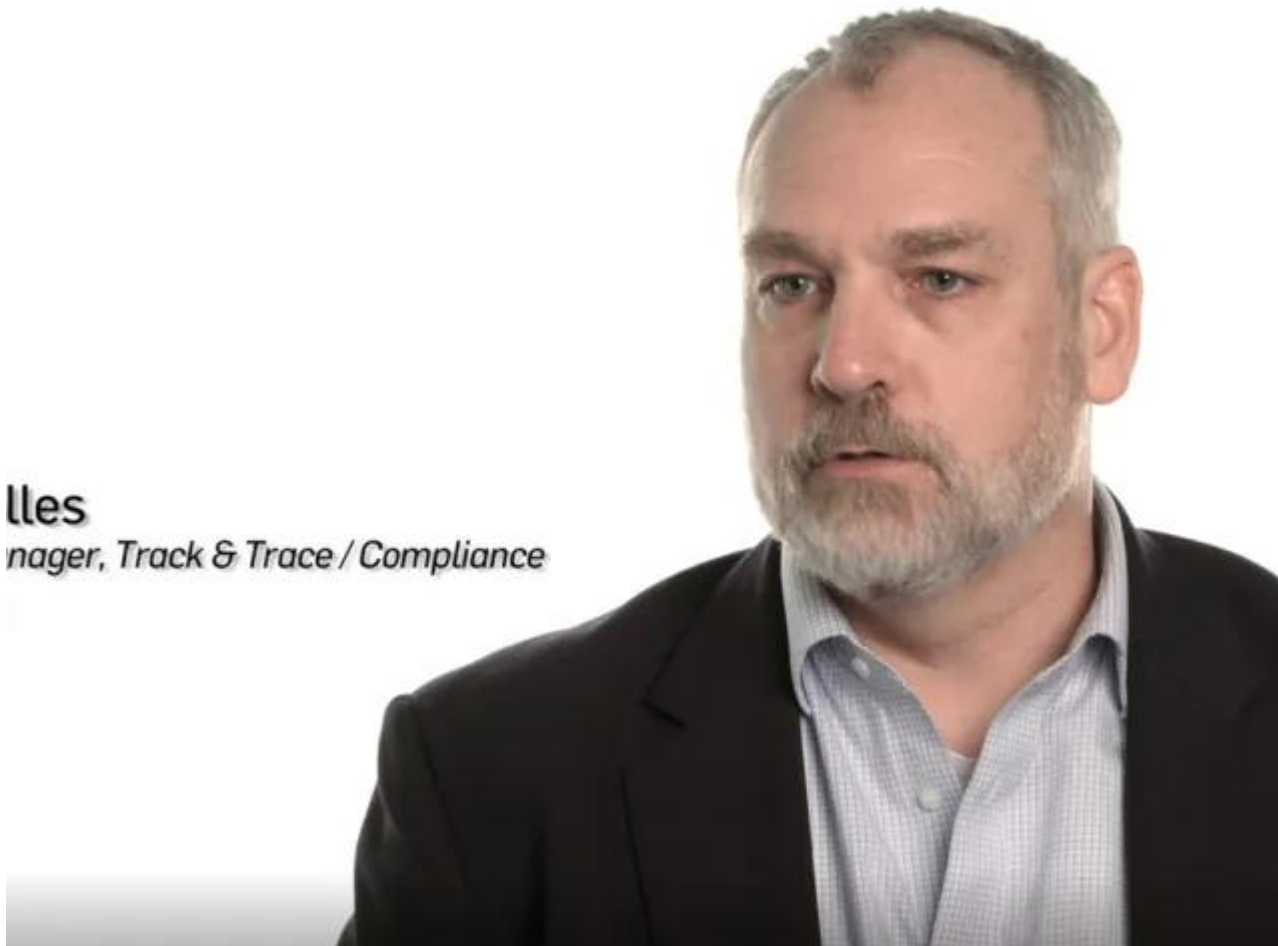
lles nager, Track & Trace / Compliance