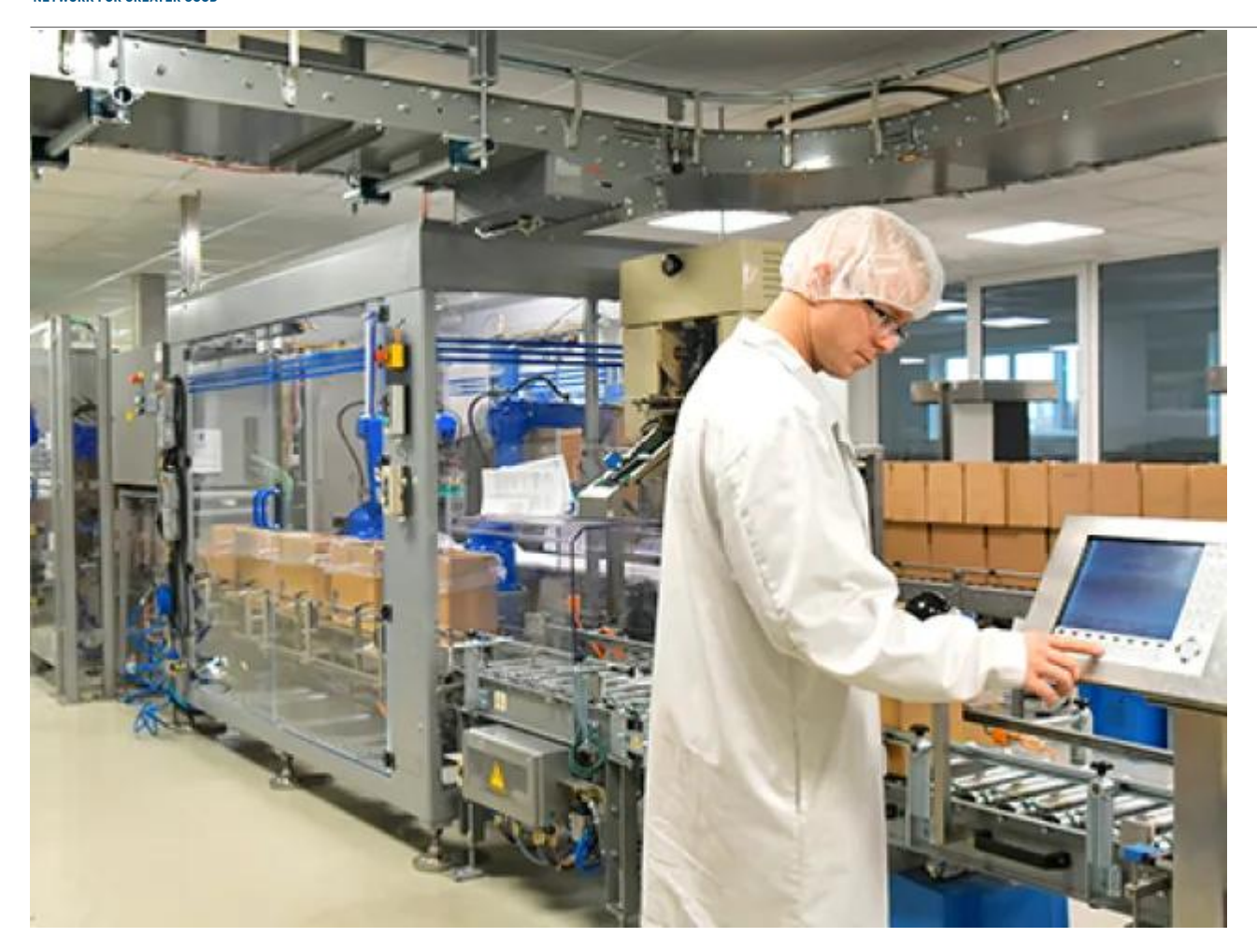
3 Ways to Optimize the End-to-End Recall Process with TraceLink

The product recall process is time consuming and labor intensive. See how TraceLink addresses the obstacles to recall efficiency with three innovative capabilities. View More