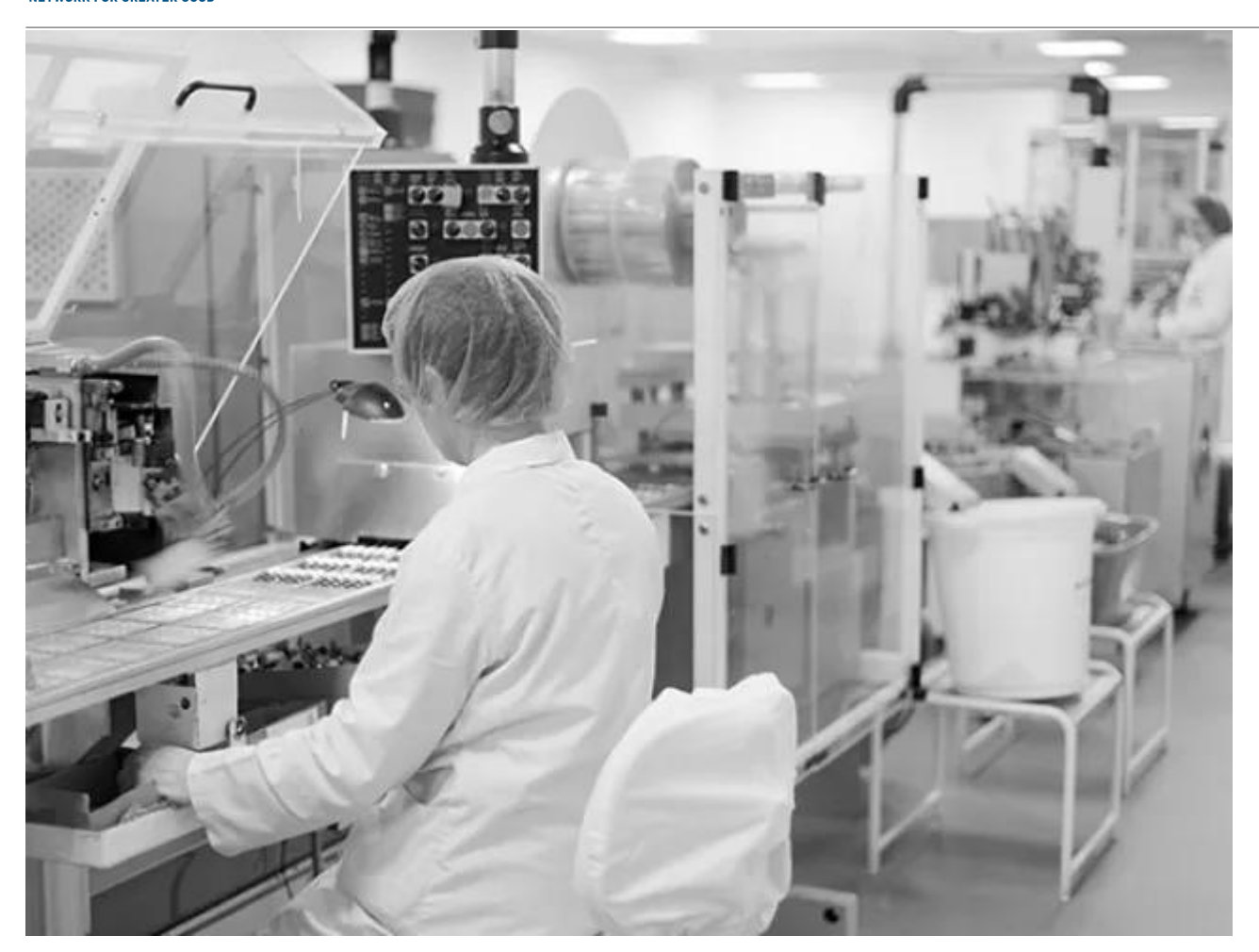
Capabilities That Health Systems and Pharmacies Need for DSCSA 2023 Compliance

DSCSA 2023 item-level traceability requirements are a step change over pharmacies' current 2015 lot-level requirements, introducing significant operational and regulatory challenges around.