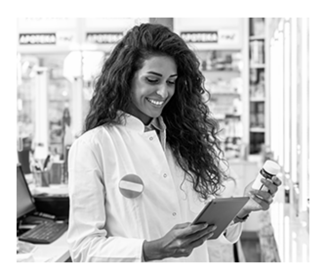
How to Prepare for Interoperable Data Exchange and the Verification Requirements of DSCSA