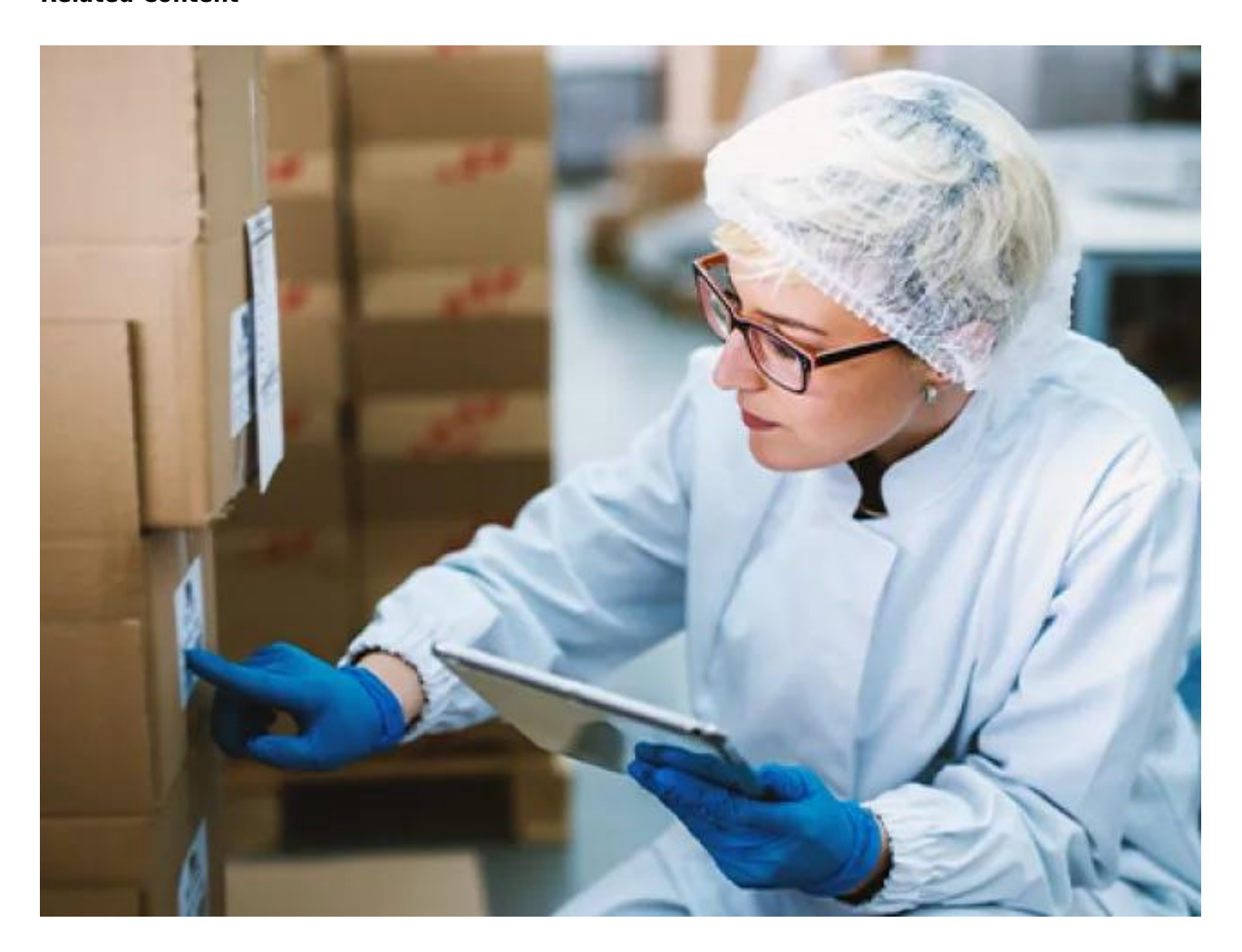
Streamline Product Recall Management with TraceLink Digital Recalls

Spend 40% less time on administrative recall tasks and 47% less time retrieving recalled products from shelves with TraceLink Digital Recalls. Watch the video to learn more!