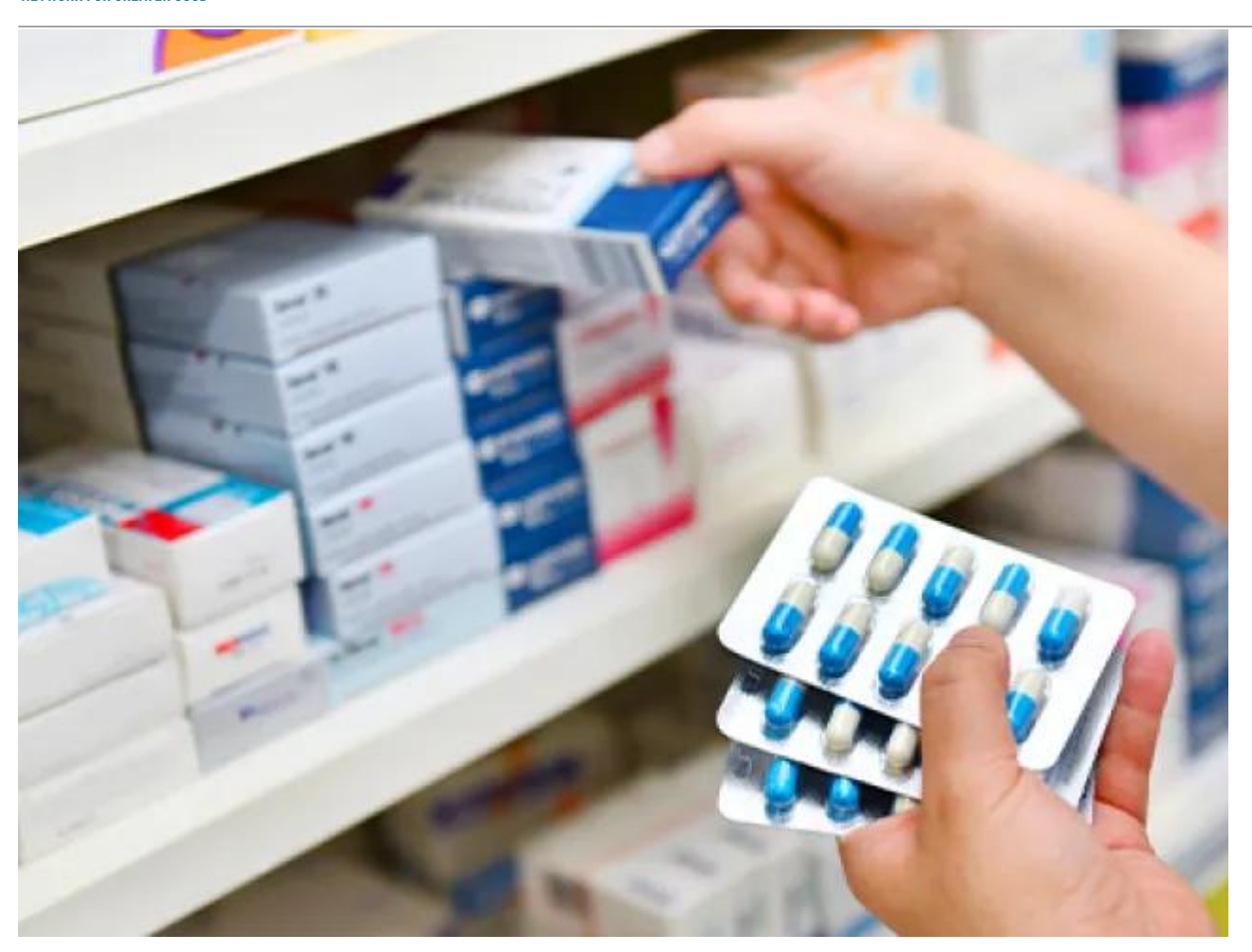
TraceLink Unveils Game-Changing Digital Recalls Solution for Health Systems and Retail Pharmacies

In a groundbreaking effort to enhance patient safety and streamline a largely manual, paper-driven product recall process in Healthcare and Life Sciences, TraceLink is proud to introduce TraceLink Digital Recalls. This innovative solution offers health systems and retail pharmacies a new approach to receiving digitalized, structured product recall information and managing those recalls with unprecedented speed and efficiency.